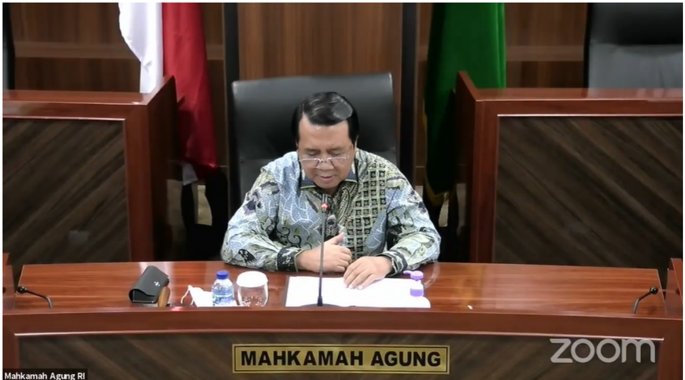
Mahkamah Agung RI